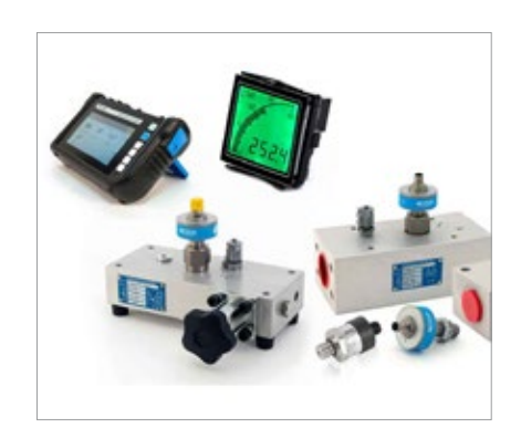
TEST STAND INSTRUMENTATION