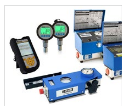
PORTABLE TEST EQUIPMENT