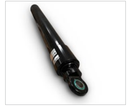
DOUBLE ACTING & TELESCOPIC CYLINDERS