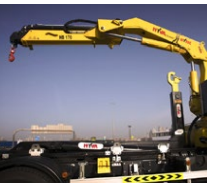
HYVA-TRUCK MOUNTED CRANES