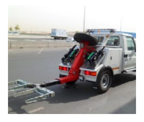
RECOVERY & TOWING SOLUTIONS