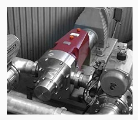
LIQUID TRANSFER PUMPS