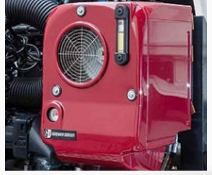
HYDRAULIC OIL COOLER / HYDRAPAK