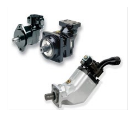
PUMPS & MOTORS